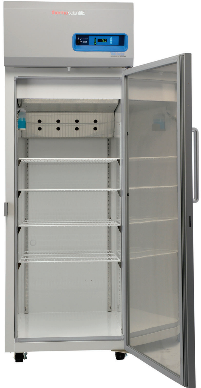
TSX Series refrigerator TSX2303SA

Other TSX high-performance refrigerators demonstrate similar energy savings. As another example, choosing the TSX2305SA high-performance laboratory refrigerator over the conventional Panasonic MPR-721-PA model would reduce energy use by 30.5%, saving more than 700 kWh of energy over the course of a year (Table 2). These savings represent 0.53 metric tons of CO 2 equivalents, or the greenhouse gas emissions from driving 1,300 miles in an average passenger car [3]. It also translates into energy cost savings of just over $75 per year [4], based on commercial sector electricity rates. The energy-efficient TSX Series refrigerators were designed with the environment in mind, which is a win for our company, our customers, and the planet.