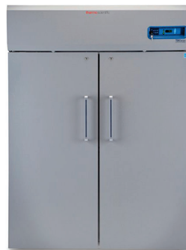
TSX Series refrigerator TSX5005SA

Our commitment to environmental responsibility doesn't end there. Our freezers and refrigerators are also manufactured in a zero waste certified facility, which means that more than 90% of the waste generated at our manufacturing site is diverted from landfills.