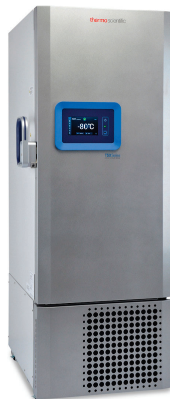
Figure 1. TSX Series ULT freezer. Available in four sizes, the smallest unit, the TSX40086 freezer shown here, can hold up to 400 boxes in a 7.42 sq. ft. footprint, while the largest unit, the TSX70086 freezer, can hold up to 700 boxes in an 11.86 sq. ft. footprint.

The TSX Series ULT freezers (Figure 1) feature V-drive adaptive control technology, designed to minimize energy consumption without sacrificing sample security. While conventional ULT freezers use single-speed compressors that continually cycle on and off, the V-drive runs the compressors at variable speeds, adjusting cooling performance to the cooling demands inside and outside the freezer. When conditions are stable, the V-drive controls the system at low speed, which helps reduce energy consumption while maintaining a stable temperature for sample protection. When there are frequent door openings or samples being added to the freezer, the system detects the activity and increases the drive speed (Figure 2).