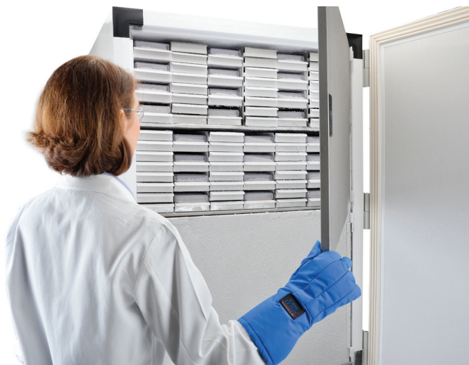
Figure 2. Adaptive control of cooling. The V-drive technology featured in TSX Series freezers is designed to detect conditions such as multiple door openings and adjust to a higher compressor speed when required.

Our commitment to environmental responsibility doesn't end there. Our freezers and refrigerators are manufactured in a facility that has achieved zero waste to landfill, meaning that more than 90% of the waste generated at our manufacturing site is diverted from landfill. Finally, the TSX Series ULT freezers operate at 45.5–49 dB, a noise level similar to that of a library [3]; this allows them to be located conveniently inside the lab.