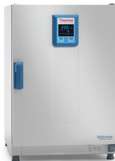
Figure 1. Heratherm refrigerated incubators, available as floor-standing and benchtop models, are used for a variety of applications, including microbiological, fungal and yeast studies; cell culture; shelf-life testing; wastewater sample testing; storage of vaccines, reagents, and antibodies; and crystallization.

The Heratherm refrigerated incubators operate on Peltier technology which, in addition to saving energy, also allows precise temperature set points—all without harmful chlorofluorocarbon or hydrofluorocarbon refrigerants. The Peltier module cools and heats thermoelectrically via an automatic control, which ensures optimal adaptations based on set temperatures. Unlike in compressor-based incubators, the Peltier module always stays above 0°C in cooling mode, preventing ice accumulation and the necessity to defrost regularly. Finally, the absence of significant vibrations in the units, compared to previous models, helps to maintain sample integrity. With these efficient features, the Heratherm refrigerated incubators use up to 84% less energy than traditional compressor-based models.