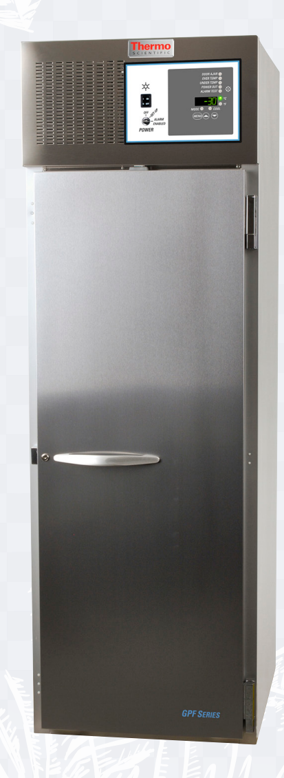
Thermo Scientific GP Series Freezer