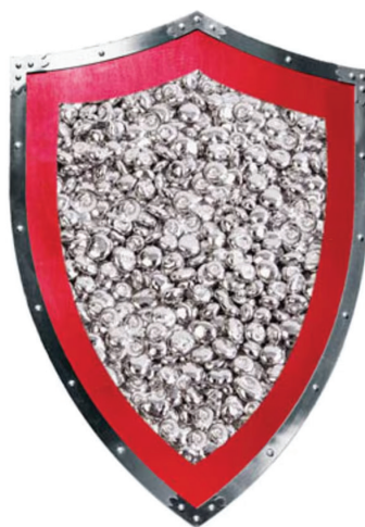
Figure 1. Gibco™ Lab Armor™ Beads

Lab Armor Beads are made of a metallic alloy and comprise nonuniform metal beads designed to replace water in a water bath. The resulting dry bath uses less electricity and fluctuates less in temperature during operation than a water bath. The reusable beads also eliminate the routine use of harmful germicides and can be cleaned with a spray of 70% ethanol. Additionally, Lab Armor Beads eliminate maintenance such as emptying, cleaning, monitoring and refilling the water bath.